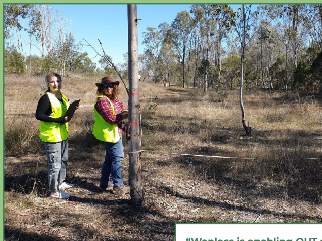
QUT students measuring out a vegetation survey site at Ebenezer.

Wanless wants to work with the Waste-Free World team to test some of their innovations. In the meantime, Wanless is partnering with QUT on research related to groundwater, surface water and vegetation. This research will contribute new knowledge and innovative ideas about how Wanless can best manage the degraded mining site. One of the first research projects off the ground is related to vegetation.